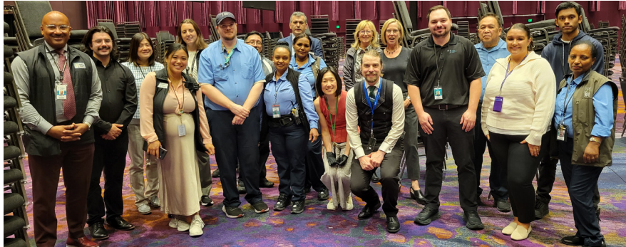
The CELA chair stacking team.

With two fully functioning event buildings, SCC teams have participated in a number of chair strikes in 2024. Teams responded to chair strike calls for eight events so far this year and stacked 30,025 chair together total.