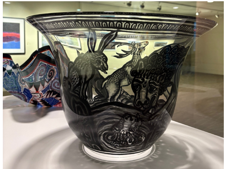
The Lion and the Well by Cappy Thompson, displayed on Level 2 of Arch.

Scan this QR code to view a library of art at Seattle Convention Center in Arch and Summit. https://hub.catalogit.app/11425/folder/eb1b49c0-3c6d-11ee-8ef6-353f9b72fac8