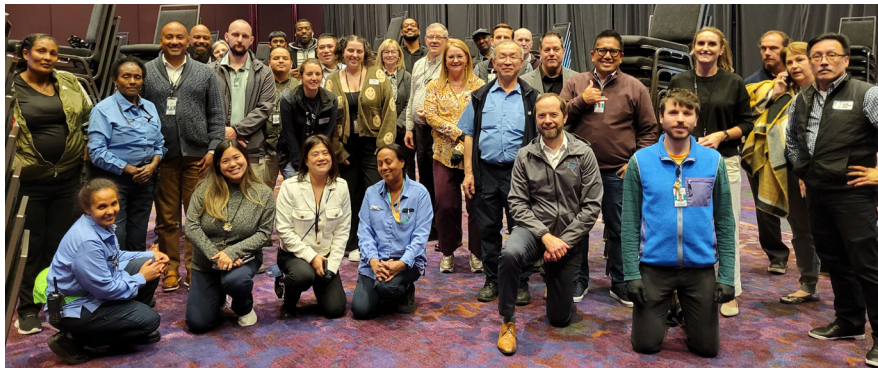
The INFORMS chair stacking team.