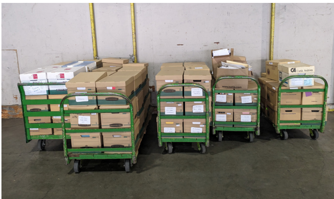
Boxes of paper waiting for shredding, stacked on carts and lining the loading dock wall.