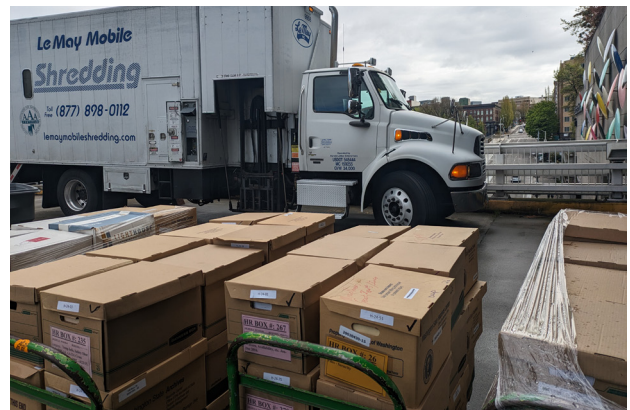
Shredding services were on site at SCC on Monday, April 29. Items were shredded in the truck at the Arch Loading Dock.