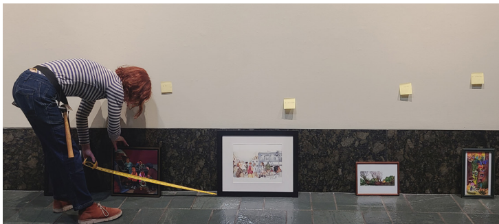
Art from the Society of Children's Book Writers and Illustrators being measured and spaced for installation on Arch Level 2.

On Saturday, April 6th, the SCC art program hosted members of the Society and their families. About 40 members gathered on Level 2 of Arch, strolled the gallery viewing the art, and clustered around tables enjoying the opportunity to draw and create art with each other. The event was held in celebration of their rotating art exhibit, on display through mid-July. The exhibit is an illustration showcase of individual works created to represent the imaginings of authors and their stories.