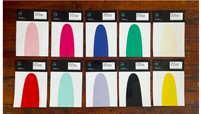
Samples of color options used for Pins.

Because of Seattle's reputation for rainy weather, some might see a parade of umbrella-wielding visitors. Capitalizing on the extraordinary sight lines and long views to and from the freeway, Capitol Hill, and Pine and Pike Streets, the art looks like a splash of colorful confetti on the downtown core.