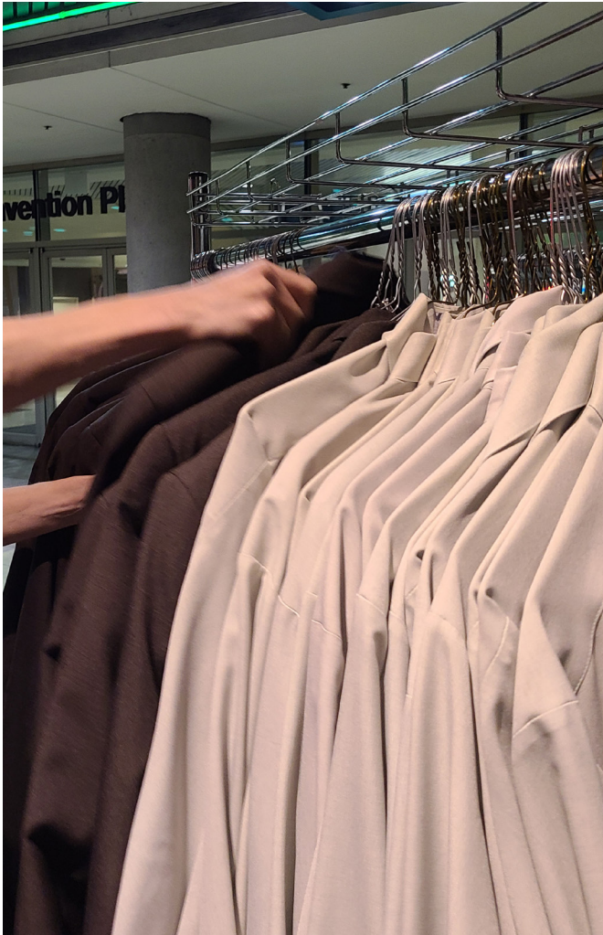
Racks of clothes were wheeled from the old Admin offices to Convention Place and into the Union Gospel Mission truck.