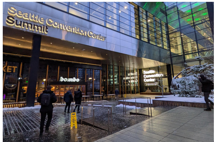
A snow day outside Summit.