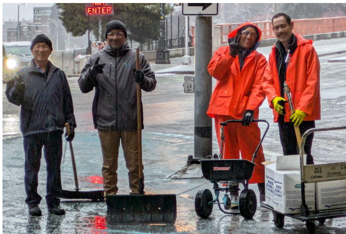
The SCC team readies sidewalks for Convention Center pedestrians.