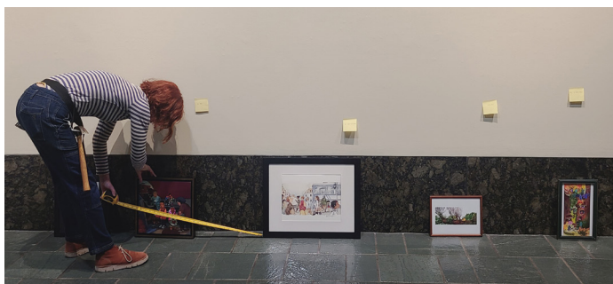
Art is measured and spaced for install on Arch Level 2.