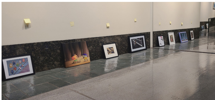
Art from the Western Washington chapter of the Society for Children's Books Writers and Illustrators lining Arch halls.