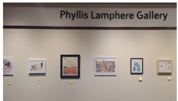
Art was installed Wednesday, January 24 and will be on display until mid-July.