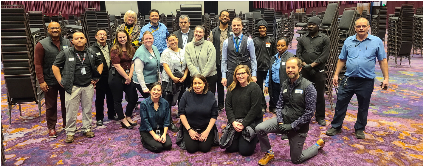
The team stacked 4,700 chairs in 27 minutes.