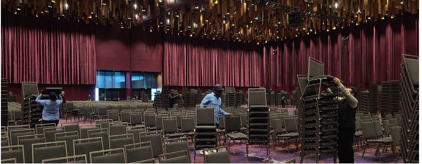
The SCC team converged on the Summit Ballroom on Wednesday, March 13, for a chair strike.