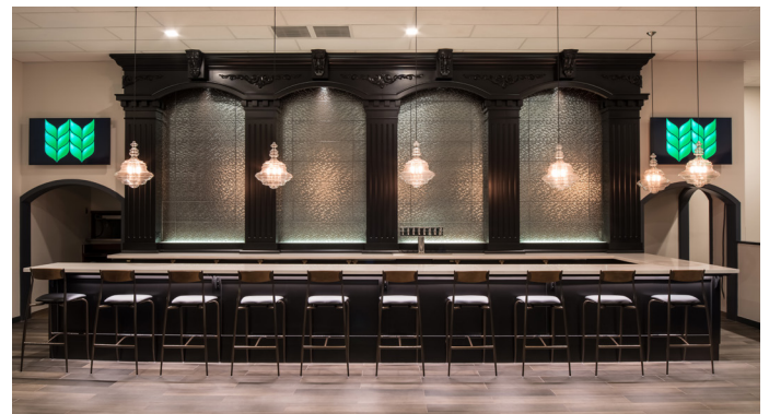
The bar in Studio 10 is nearly 25' long.

In order to provide a consistent and professional level of service, SCC uses service partners for the services described below. Each of these providers will assign a dedicated contact to work with you and your team.