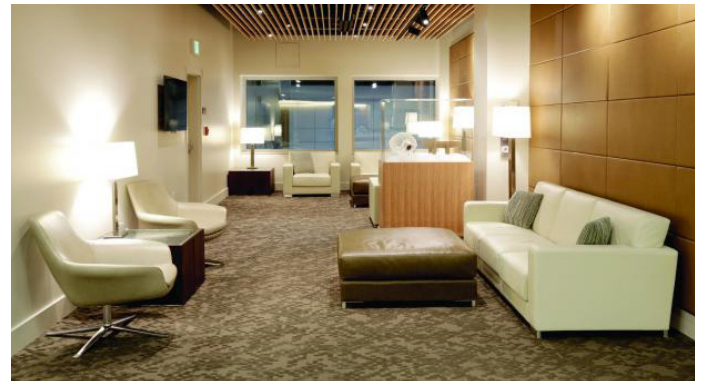
Guest Lounge in 800 Pike

approval process. Your EM can provide basic maximum room set diagrams for your meeting rooms, and create food & beverage function diagrams, but technical meeting room and general session diagrams should be supplied by your AV provider.