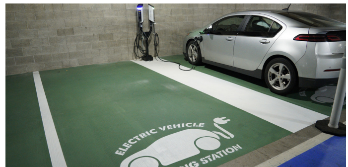
Main Parking Garage, Electric Vehicle Charging Station

We look forward to serving you at Seattle Convention Center!