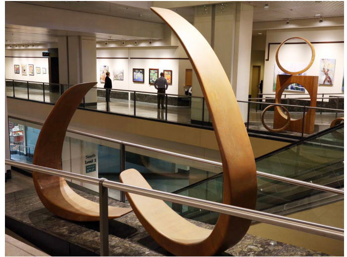
Level 2 Phyllis Lamphere Gallery