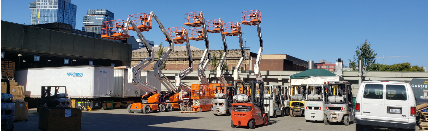
North Loading Dock