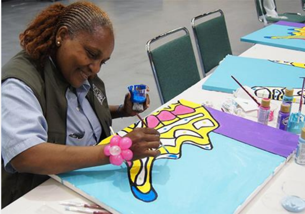
A WSCC employee enjoys painting for the Art Fest project

Foundation, Plymouth Housing Group, Solid Ground and Neighborhood House with bright and inspiring artwork for their public spaces. Celebrations to deliver and commemorate the finished paintings are planned for fall of this year.