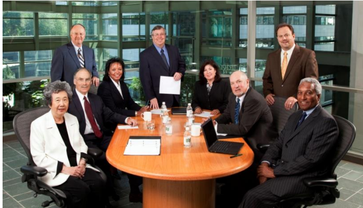
Washington State Convention Center – Board of Directors